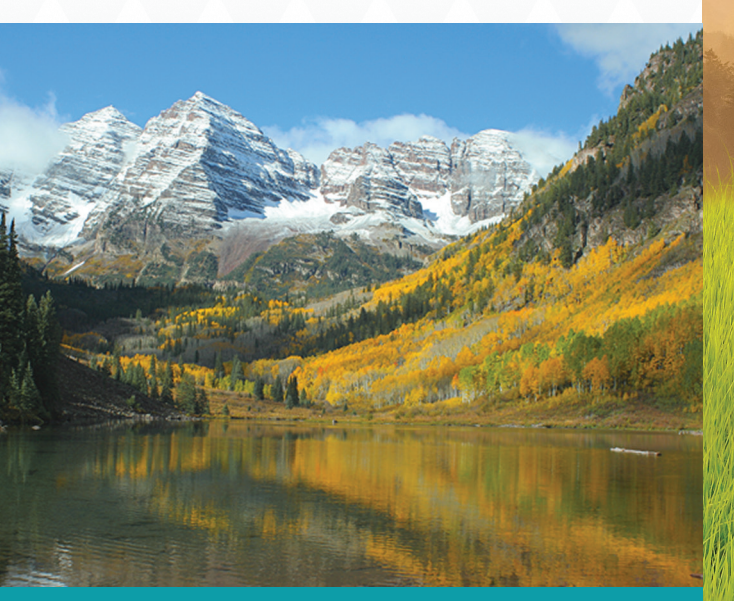
The highest peak in the park is at Longs Peak, at 14,259 feet. There are 359 miles of trails in the park to explore. There are 260 miles of trails for horseback riding in the park.